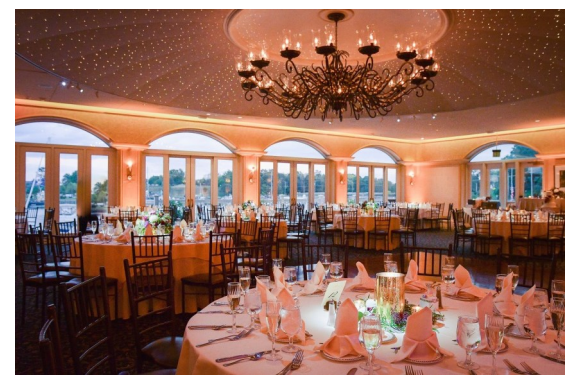
A brand new event for ladies only and an all-pink affair! Enjoy a fabulous brunch at the Chesapeake Inn with cocktails, vendors and entertainment.