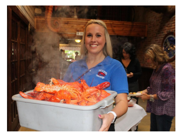
Two seatings, each of 300 people. Tickets are good for 5 p.m. seating. All-you-can-eat lobster, land and seafood buffet with a variety of side dishes. Full bar available.