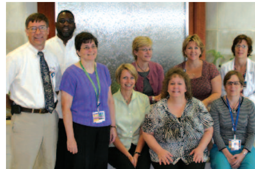
Union Hospital's Stroke Committee was instrumental in helping us to be designated a Primary Stroke Center.

Our new capsule endoscopy technology gives physicians greater detail of the entire small intestine to help them diagnose digestive tract disorders and diseases such as polyps, inflammatory bowel disease, ulcers and tumors. This noninvasive procedure involves a small video camera in a pill that, while it moves through the digestive tract, transmits more than 50,000 images to aid diagnosis.