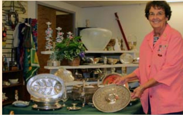
A volunteer shows off a few of the many “treasures” found in the Good-As-New Shop.

surpassing the $1 million mark in 2006. “That’s a lot of two-dollar sales,” jokes Lightcap who, like most of the 25 volunteers who regularly staff the shop, has been working in the store since it opened. “In addition to fund raising, we also perform a valuable service for the community as a place where people in need can find clothing they can afford.”