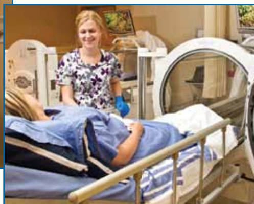
State-of-the-art hyperbaric oxygen therapy helps speed the healing of wounds, while a multidisciplinary team of specialists provides personalized care for your particular needs.